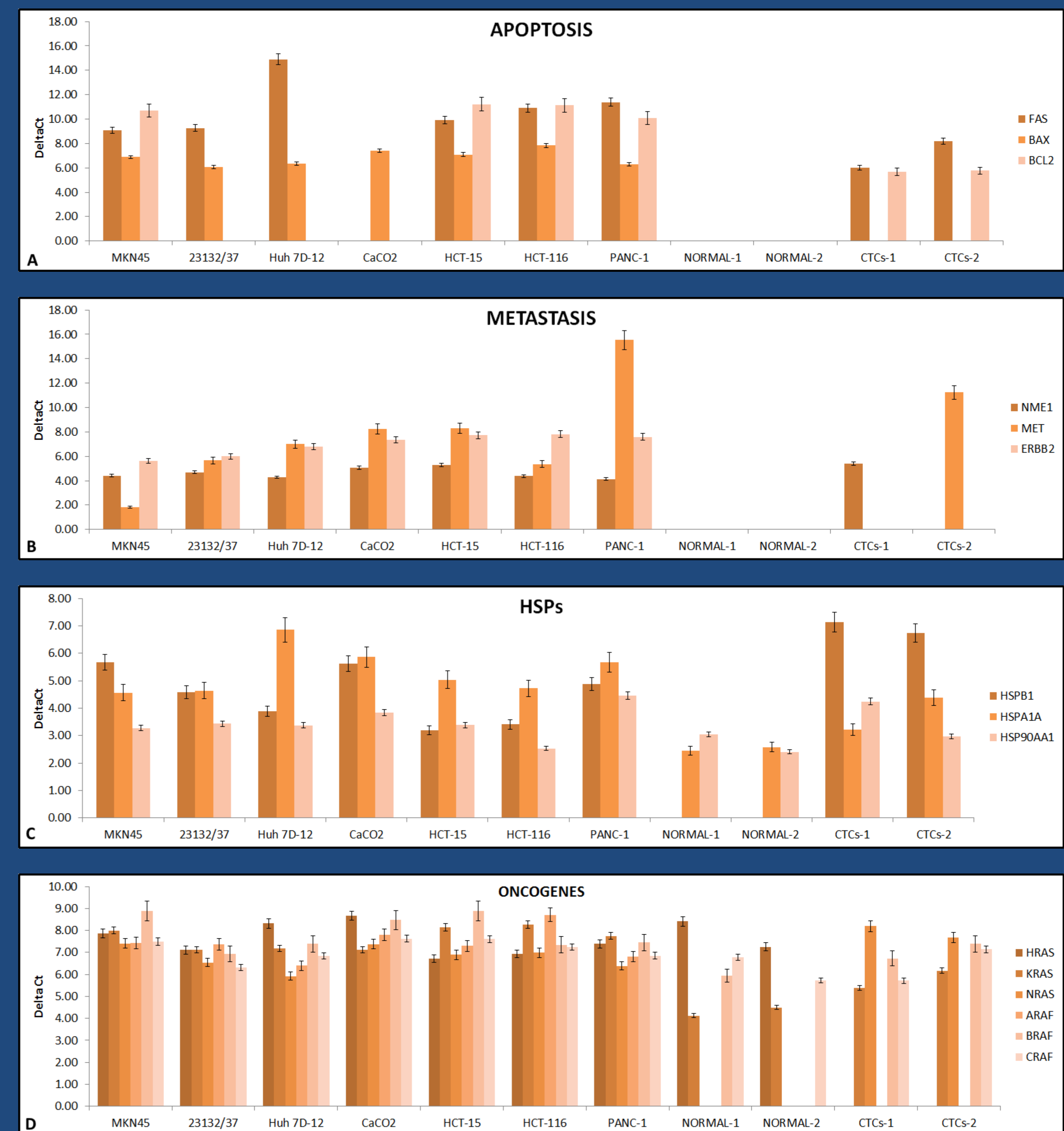
Figure 1: Delta Ct qPCR Data among all samples. The higher the DeltaCt the lower the gene expression. Absence of bar indicates no expression in the appropriate sample.

Results: The genes ERK1, ERK2, CDC6, JAK1, JAK2, FAS, NRAS, BCL2, NME1 and HSPB1 were not expressed in normal samples. In CTCs there was not observed expression for JUN, ERCC1, RRM1, HRAS, MAP2K kinases, as well as TGFB2, TGFB3, CDKN2A, TP53, KIT, GART, DPYD and TYMS. On the contrary, patients-derived cells' gene expression was higher for ERK2, PTEN, RPSA, JAK1, JAK2, FAS, KRAS, TGFB1 and NANOG. The clustering method efficiently discriminated cancer cells from normal samples, while it categorized in different clusters the commercial colon cancer cells from colon CTCs.